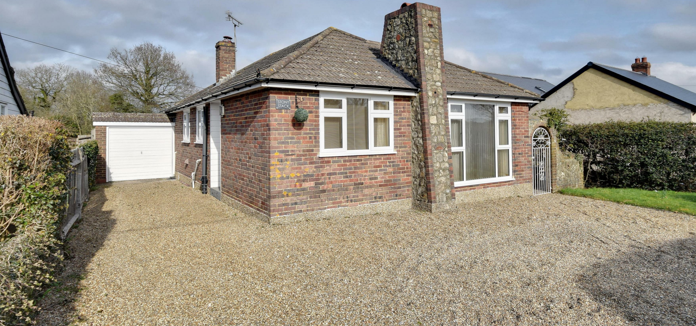
Stonystack Ashford Road, Bethersden, Kent TN26 3BD Guide Price £465,000